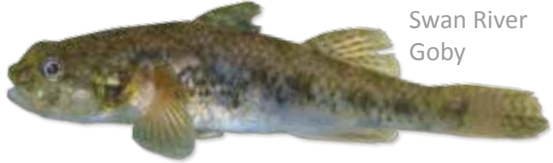
Swan River Goby