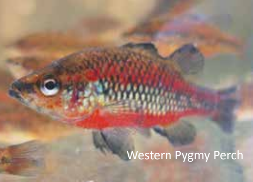
Western Pygmy Perch