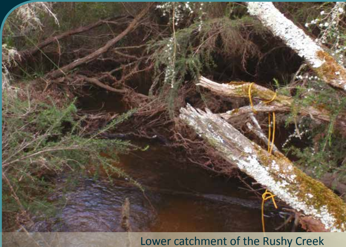
Lower catchment of the Rushy Creek

A snapshot of the condition of the Rushy Creek